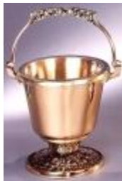
Holy Water Container